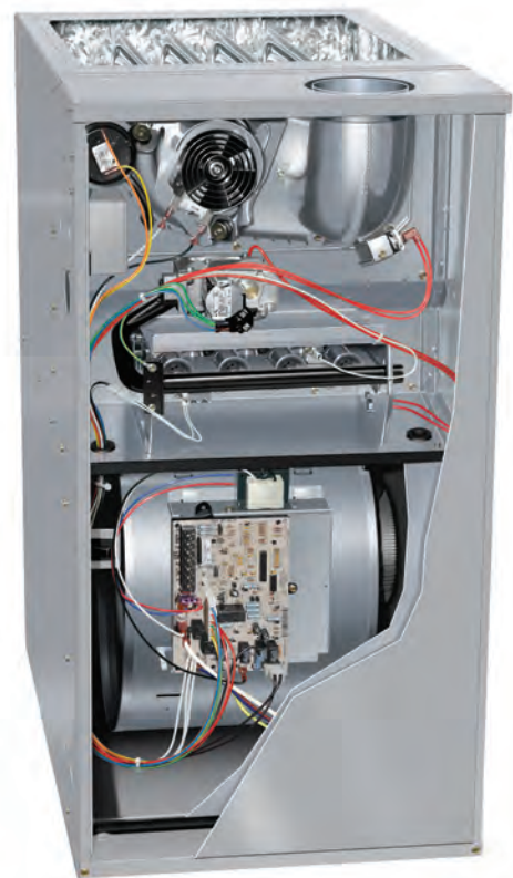
N80 Gas Furnace

* To the original owner, Airquest products are covered by a 10-year parts limited warranty upon timely registration. The limited warranty period is five years if not registered within 90 days of installation except in jurisdictions where warranty benefits cannot be conditioned upon registration. See warranty certificate for complete details.