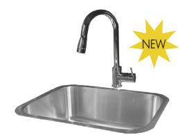
Stainless Under mount Sink

Double Faucet, Complete with Valve Kit, Strainer & Hook Up, Swing Angle, Hot & Cold Water