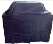
Grill Cover for Cart