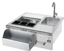
Agape Beverage Center

No need to worry, your beverages and food will stay cool all through the hot summers with the many choices of different sinks and refrigeration options we offer.