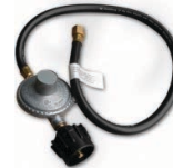
LP Hose & Regulator RONHK