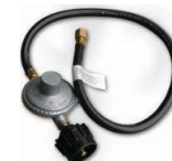
LP Hose & Regulator RONHK