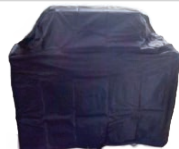
Grill Cover for Cart