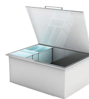
Drop-in Cooler with Condiment Tray

Sink, Bottle Opener, Towel Rack, Faucet, Trays, Drain, Insulated Ice Compartment