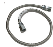
Stainless Gas Connection SSFLEX6436 OR 48