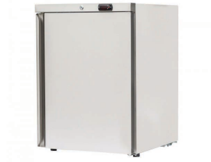
UL Rated Refrigerator

Reversible Hinge, 4.6 Cu. Ft., Door Lock, Interior Light, Adjustable Thermostat & Shelves, Glass Interior, Drawers, Automatic Defrost