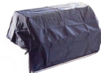
Grill Cover for Drop-In Grill