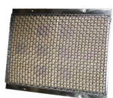
Grill Infrared Burner IR2632