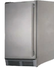
UL Rated Ice Maker

Reversible Hinge, 5.6 Cu. Ft., UL Certified for Outdoor use, LED Adjustable Thermostat