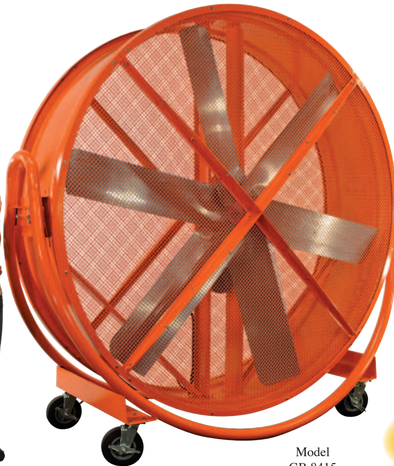
Model GB 8415