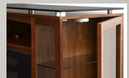
90 DEGREE SIDE SWING DOORS