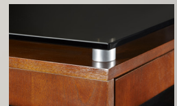
SMOKE TEMPERED 10MM GLASS TOP