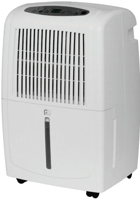
BUCKET W/ HANDLE