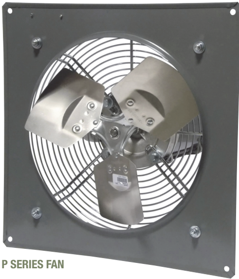
P SERIES FAN