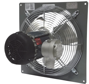
P4 SERIES EXPLOSION PROOF MOTOR

Designed for Industrial, Commercial & Farming applications.