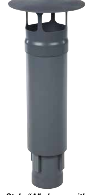
Style "A" shown with Style "B" Stack