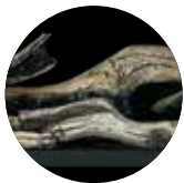
Top Sail Driftwood