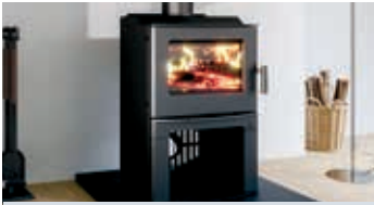
SW1.2 Wood Stove