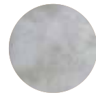
Stone Bridge Stucco