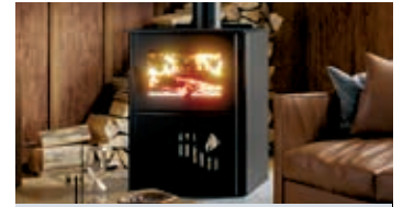
SW2.5 Wood Stove