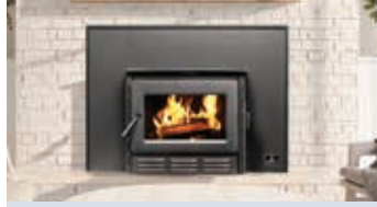
SW1.8 Wood Stove