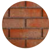
Aged Red Brick