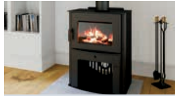
SW2.0 Wood Stove