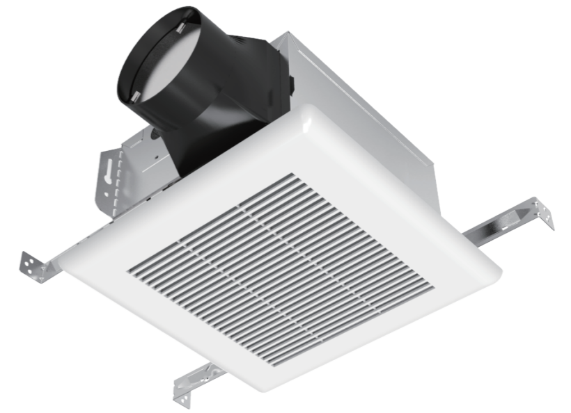
Optional LED Light grille