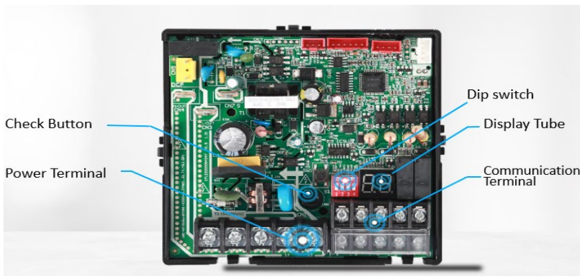
Set DIP Switches As Shown Below